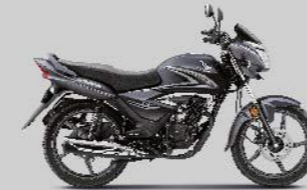
GENY GREY METALLIC